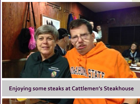
Enjoying some steaks at Cattlemen's Steakhouse