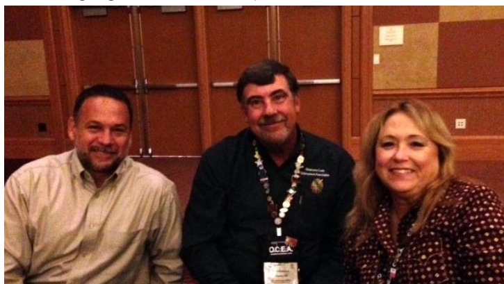
Edmond gang at the AACE Banquet