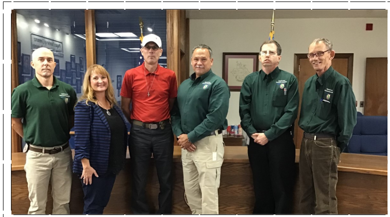
Left—Masked students in Class Above—OCEA Board at Meeting in Prague Below—Fun at OCEA Board Meeting in Norman near Christmas time