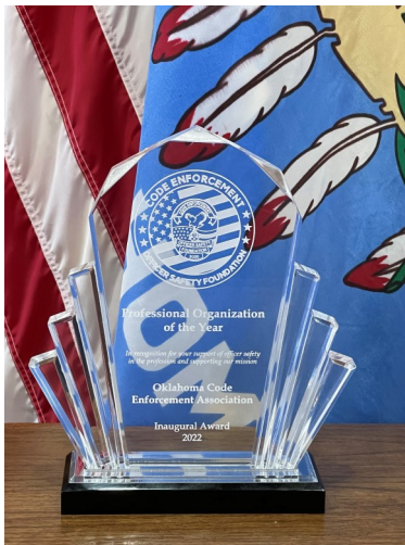
The Award that OCEA was presented from CEOSF