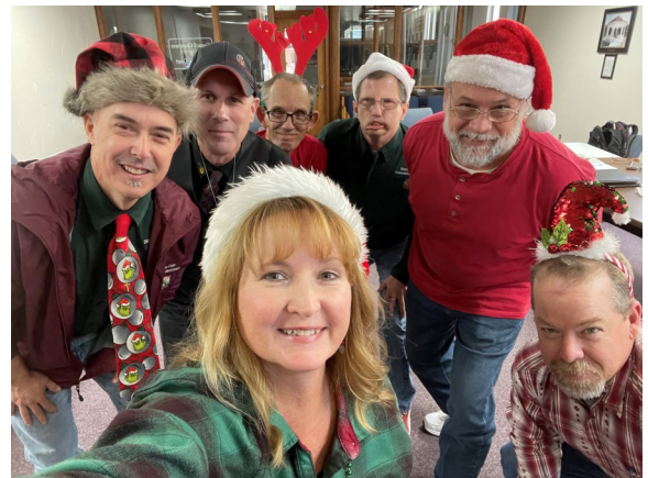
Your OCEA Board likes to have fun at our Board meetings and spread some holiday cheer.