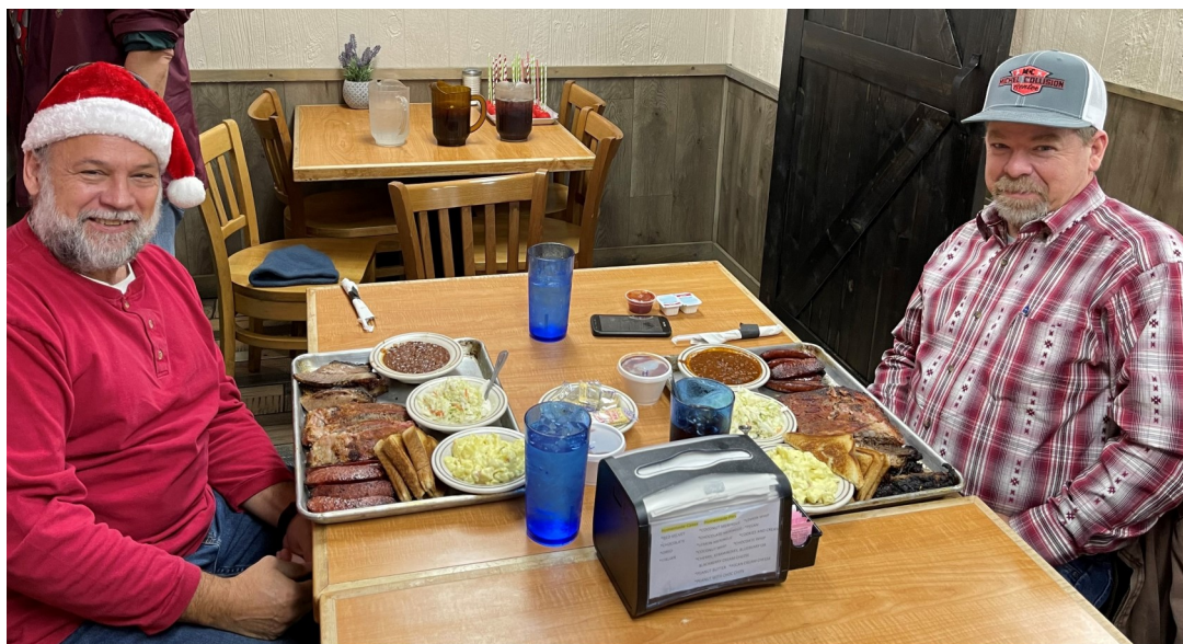
Look at the size of these platters!!! These two put the hurt on a lot of BBQ at lunch. We do like to EAT at our events!